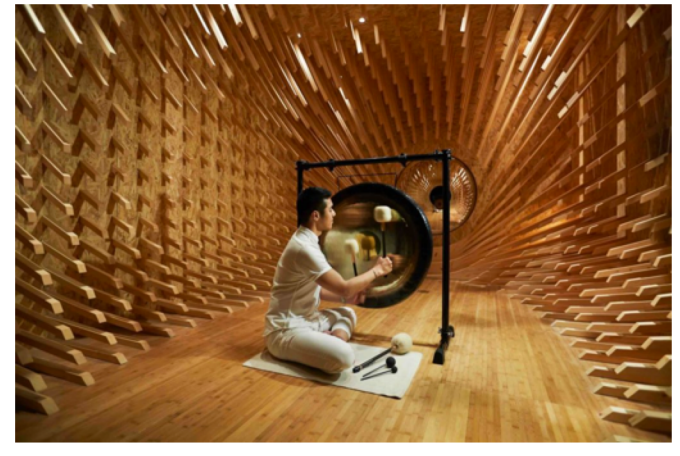
Gong master located within MINAX's The Wonder Room .