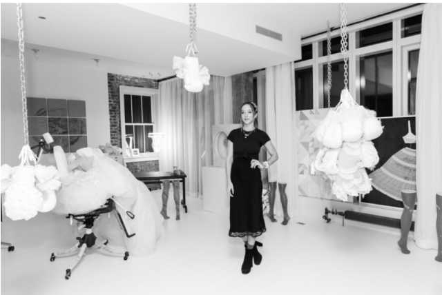
L and Right: Yvonne Tnt/BFA