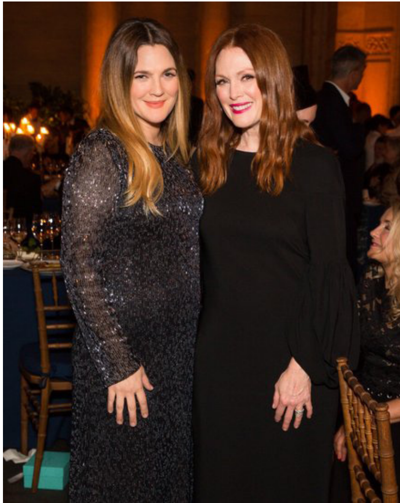
Drew Barrymore and Julianne Moore.

Last night, ACRIA, the research and education organization dedicated to helping people with HIV and AIDS live longer and healthier lives, held its 20th Annual Holiday Dinner at the majestically domed Cunard Building in the Financial District.