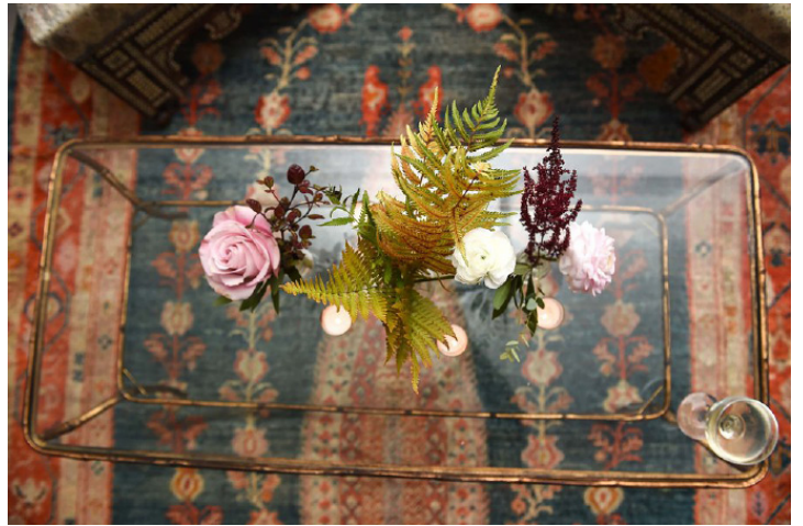
L to R: The scene inside Bathhouse Studios; The flowers at the party