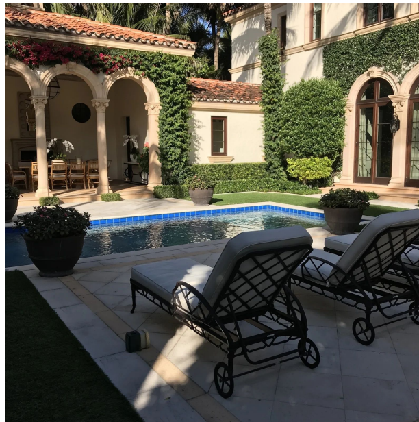
One of the houses on our collection tour made me wonder why we don't all move to Palm Beach. A two-bedroom bungalow will set you back less than a studio apartment in New York City.