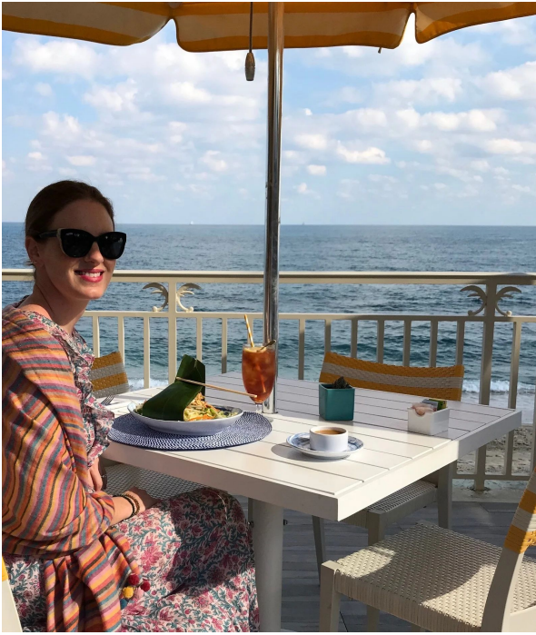
Left: I arrived at the Eau Hotel in Palm Beach having had almost no sleep the night before, with both kids in my bed. When I sat down at the Eau's beachside restaurant for a healthy lunch and a view of the ocean, I felt restored.