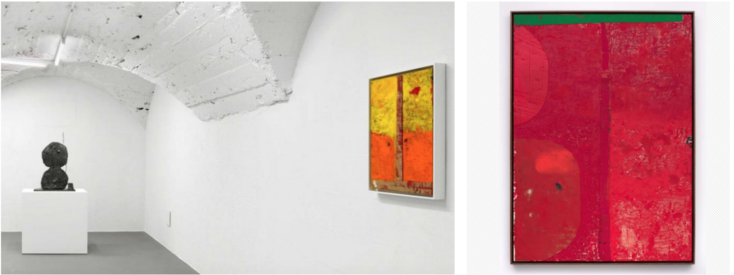
L to R: Sterling Ruby has filled the Vito Schnabel Gallery with a range of artistic media; Half Tetrad (6391), 2017 © Sterling Ruby

Because of this natural, almost effortless curatorial approach, each piece converses with the next beautifully. Indeed, the diversity of works on display only seems to emphasise the varied, weather-beaten landscapes Ruby rambled through in search of inspiration.