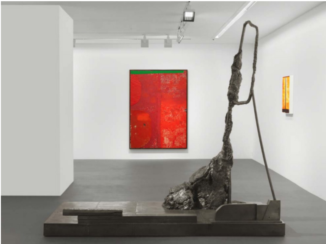
Installation view of 'Modern Hiker', by Sterling Ruby, 2017. © Sterling Ruby.

Master of variety Sterling Ruby seems addicted to testing out new mediums. His artistic diversity knows no bounds. Through his sculptures, installations, paintings, ceramics and textiles, he somehow manages to flit between myriad artistic styles, from expressionism to minimalism to vandalism.