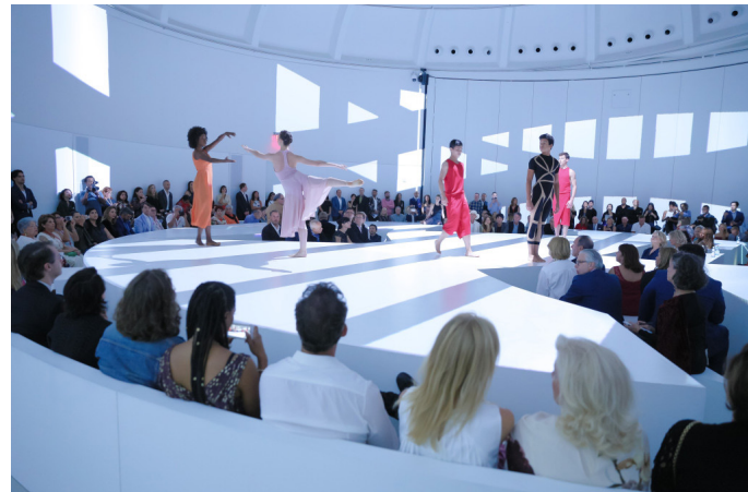
The atmosphere at the Faena Forum Opening Party.