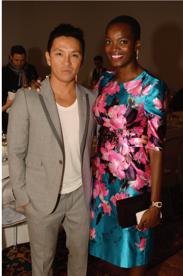
Prabal Gurung and Njideka Akunyili Crosby

This year's iteration of New Museum's Next Generation Dinner was a steamy affair.